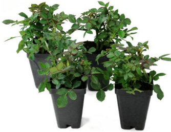
SHIPPED IN 2.5-INCH POTS. PLANT SIZE MAY VARY BASED ON GROWING CONDITIONS.

Note: Some leaves may appear wilted or yellow upon arrival. This is due to the stress of shipping and is nothing to worry about. Water the plant and let it recover in a shady location for a few days, then gently remove any foliage that does not recover to allow for new growth.