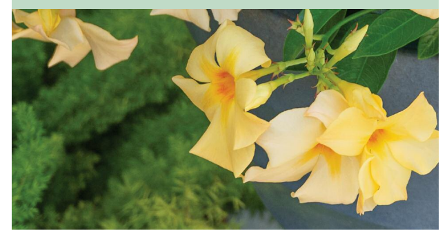
*Image on cover is representative of the type of plant(s) in this offer and not necessarily indicative of actual size or color for the included variety.