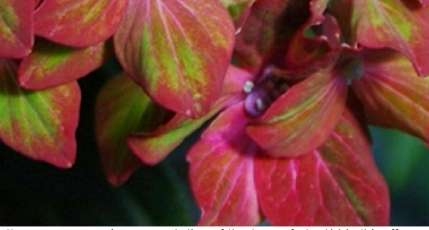
*Image on cover is representative of the type of plant(s) in this offer and not necessarily indicative of actual size or color for the included variety.