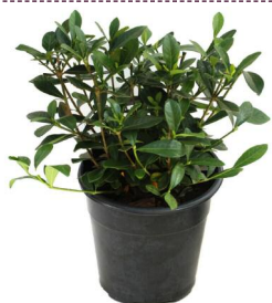
SHIPPED IN A 5.5-INCH POT. PLANT SIZE MAY VARY BASED ON GROWING CONDITIONS.

Note: Some leaves may appear wilted or yellow upon arrival. This is due to the stress of shipping and is nothing to worry about. Water the plant and let it recover in a shady location for a few days, then gently remove any foliage that does not recover to allow for new growth.